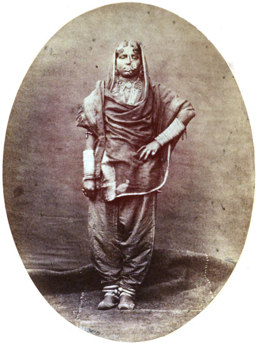
DANCING GIRL. HINDOO. SIND. 340.