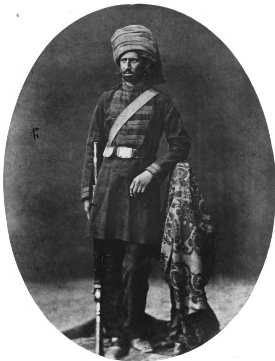
PRIVATE FIRST BELOCH REGT. AFGHAN. SOONNEE MUSSULMAN. SIND. 327-2.