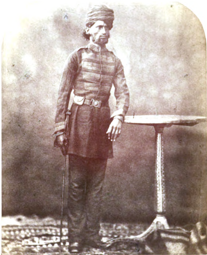
PRIVATE SECOND BELOCH REGT. SOONNEE MUSSULMAN. SIND. 328.