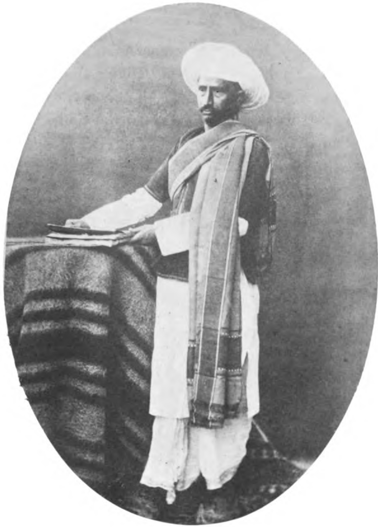
SHROFF OR NATIVE BANKER. HINDOO. SIND. 350.