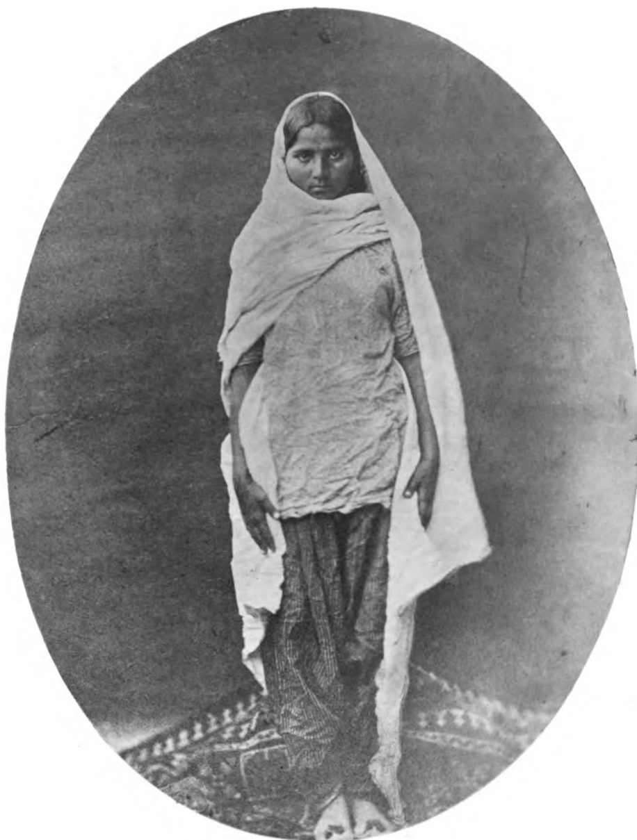
SINDEE WOMAN. MUSSULMAN. SIND. 319.