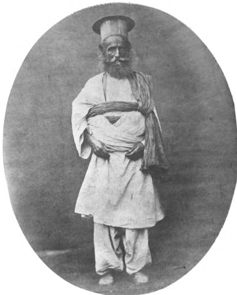
A BOORGAREE. BELOCH. SOONNEE MUSSULMAN. SIND. 297.