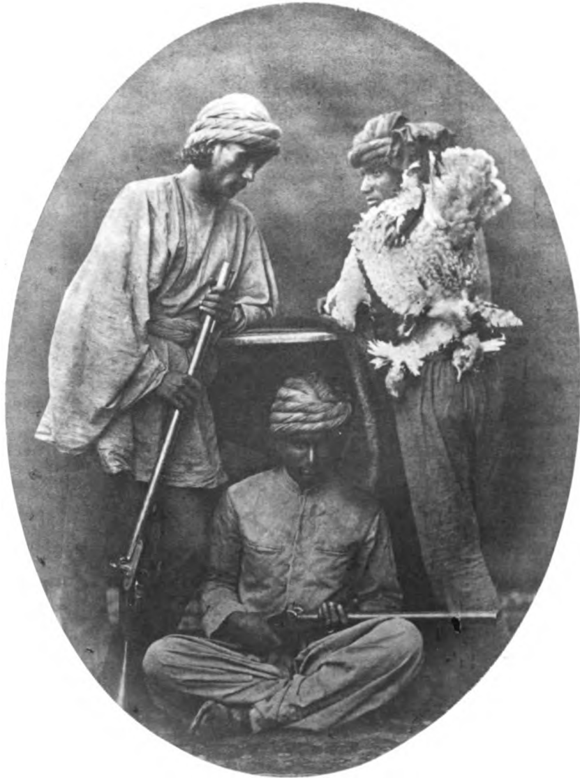
DAPHERS OR SHIKAREES. HUNTSMEN AND SCAVENGERS. MUSSULMANS. SIND. 326.