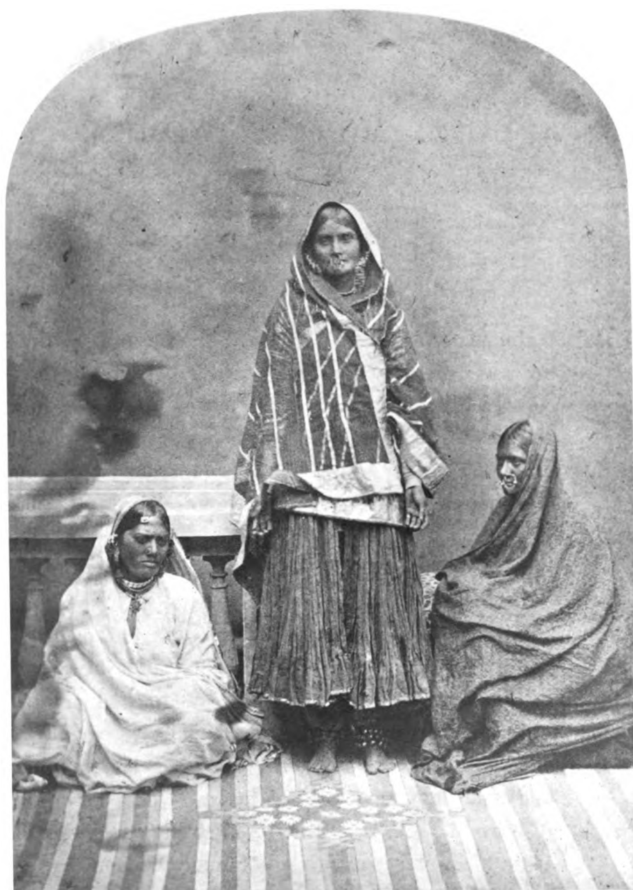
MOHANA WOMEN. SOONNEE MUSSULMANS. SIND. 338.