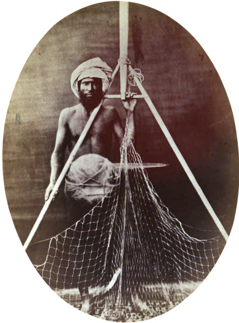
MOHANA. FISHERMAN. SOONNEE MUSSULMAN. SIND. (337-2)