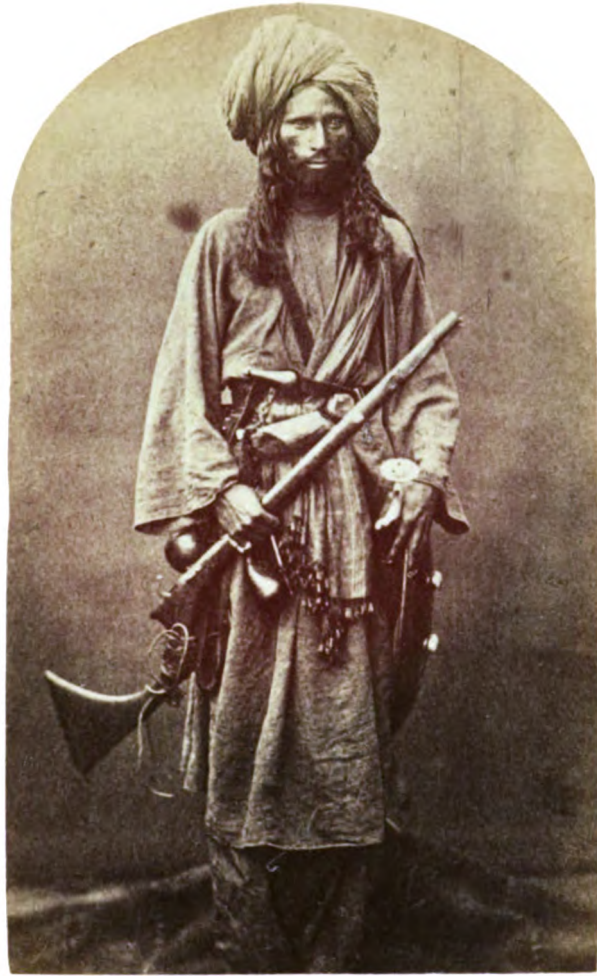
A KHOSA. BELOCH FRONTIER TRIBE. SOONNEE MUSSULMAN. SIND. (307)