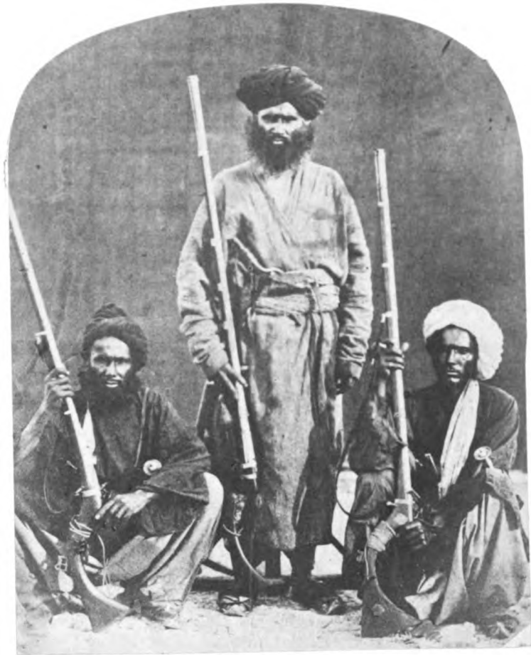
JOKYAS. MUSSULMANS. SIND. 313.