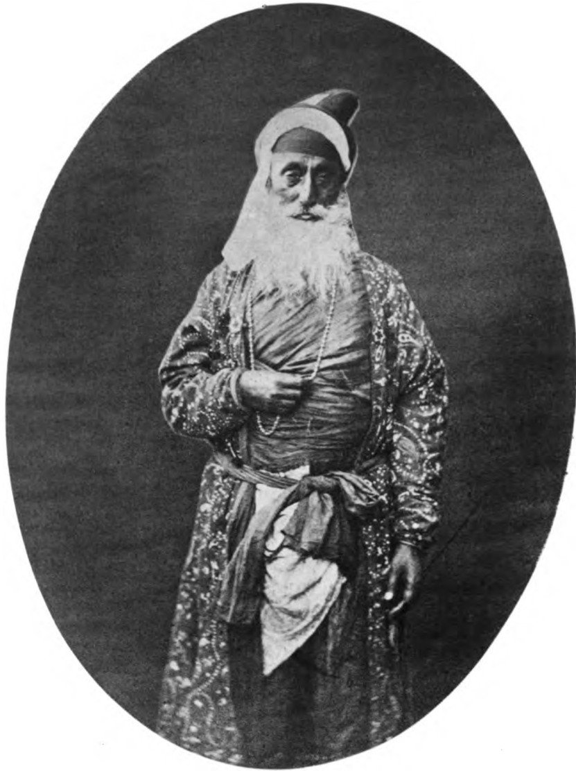
SIKH AKALI. FROM THE PUNJAB. SIKH. SIND. (324)