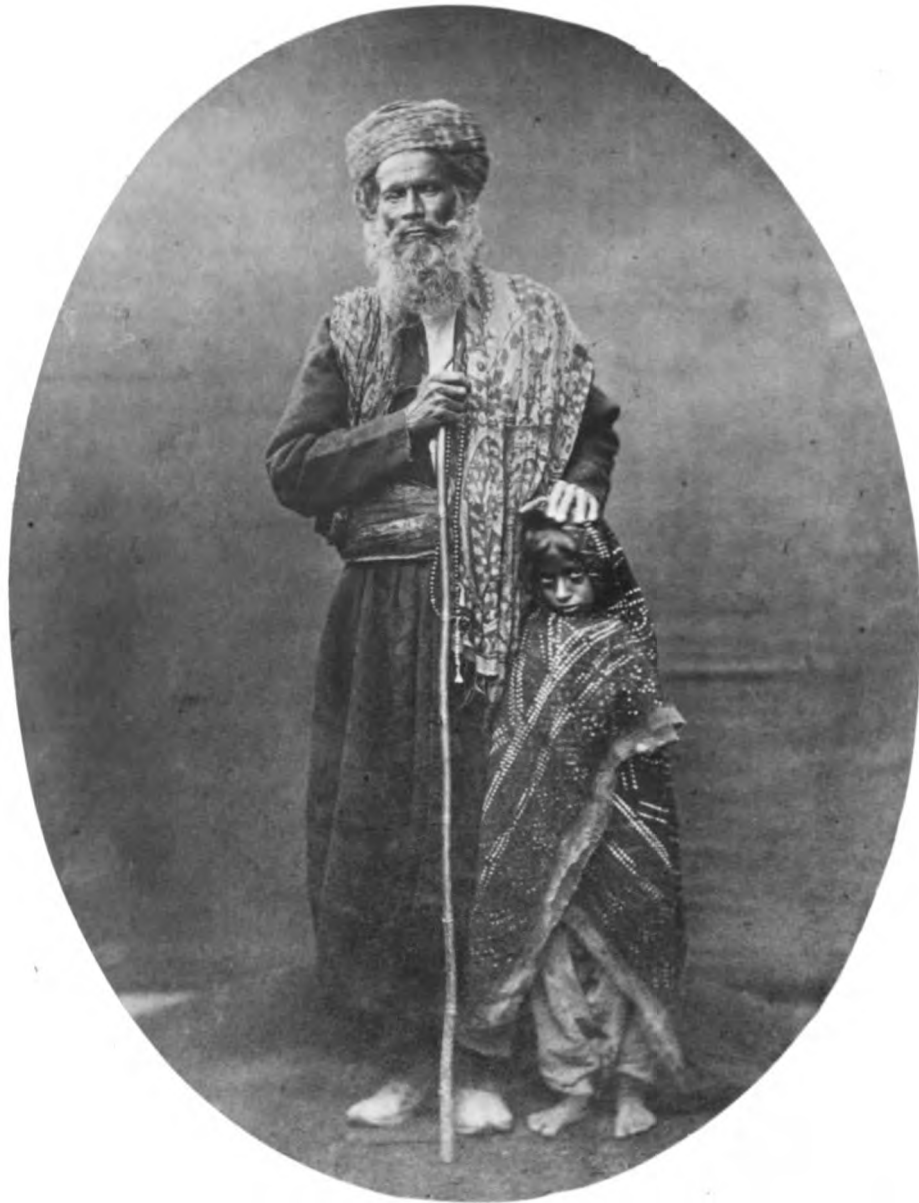
A NOOMRYA AND HIS DAUGHTER. SOONNEE MUSSULMANS. SIND. (312)