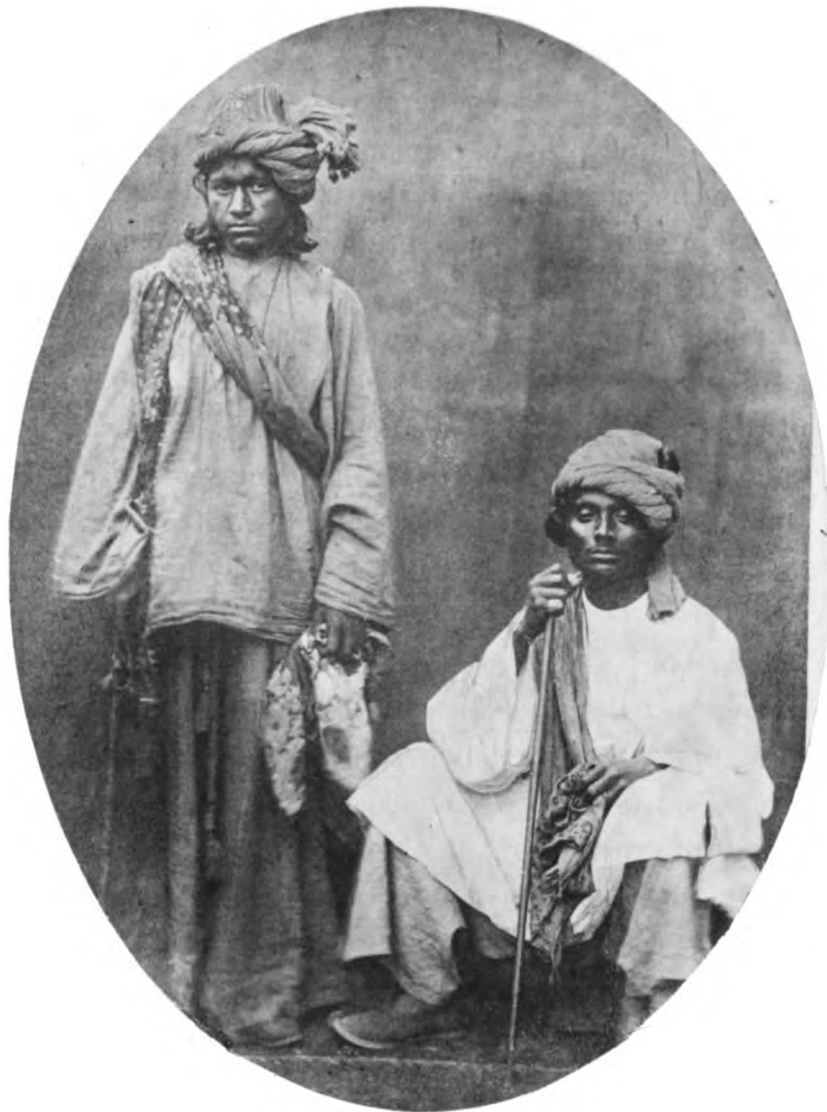
TWO SINDEES. SOONNEE MUSSULMANS. SIND. 318.