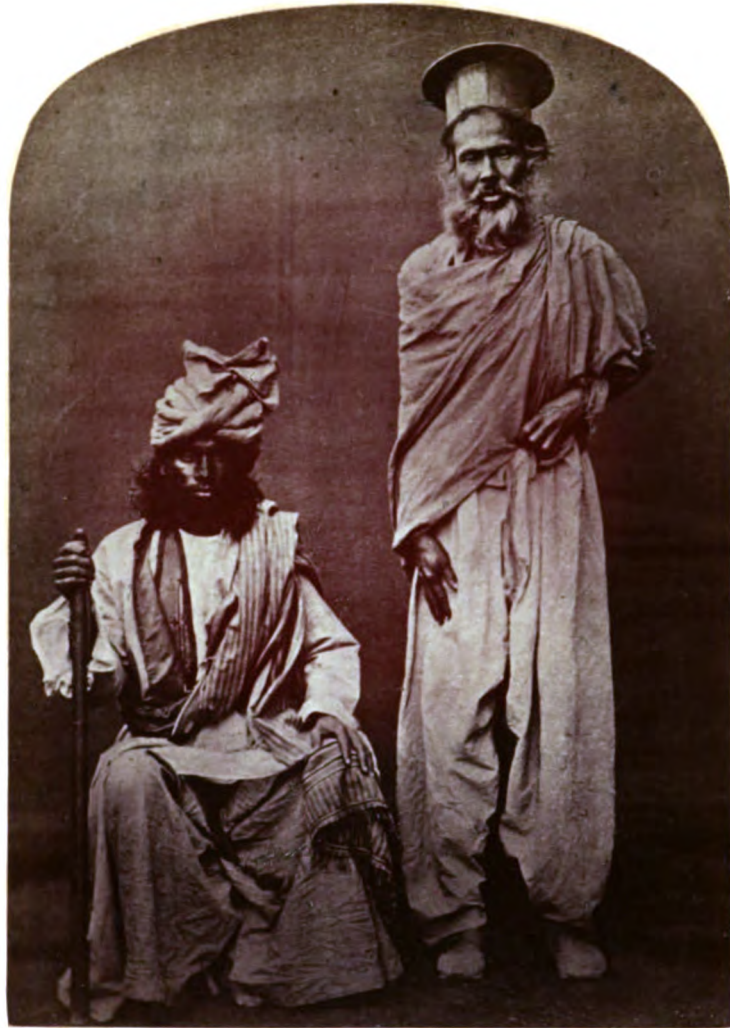
A SINDEE AND BELOCHEE. MUSSULMANS. SIND. 911.