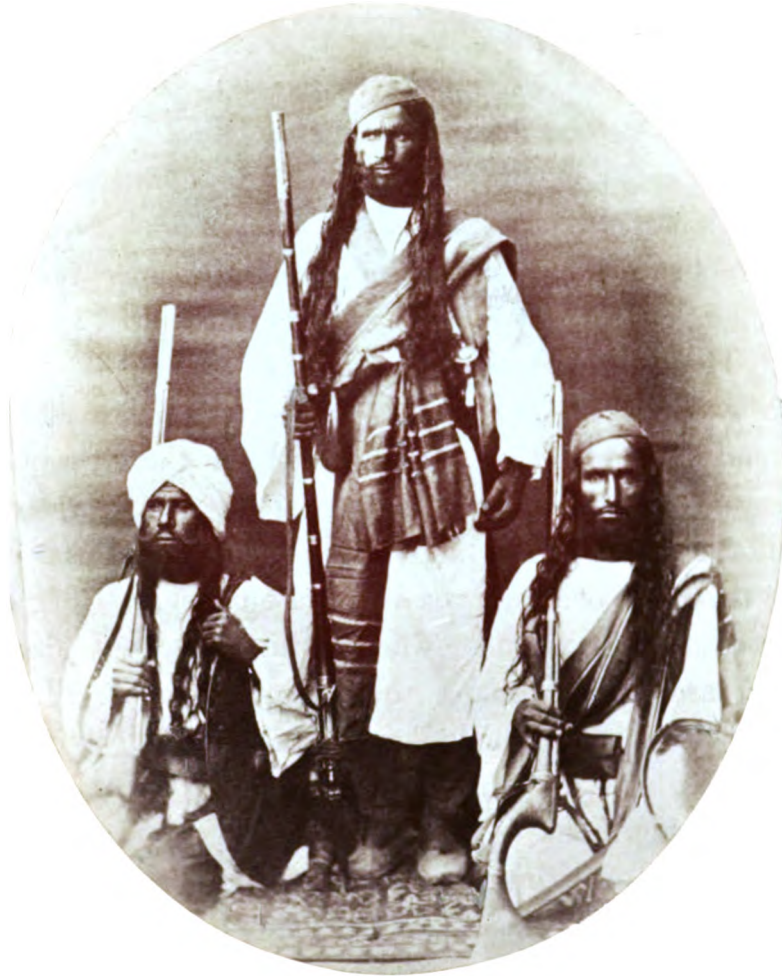
BRAHOOEES. INHABITANTS OF KHELAT STATE. SOONNEE MAHOMEDANS. SIND. 321.