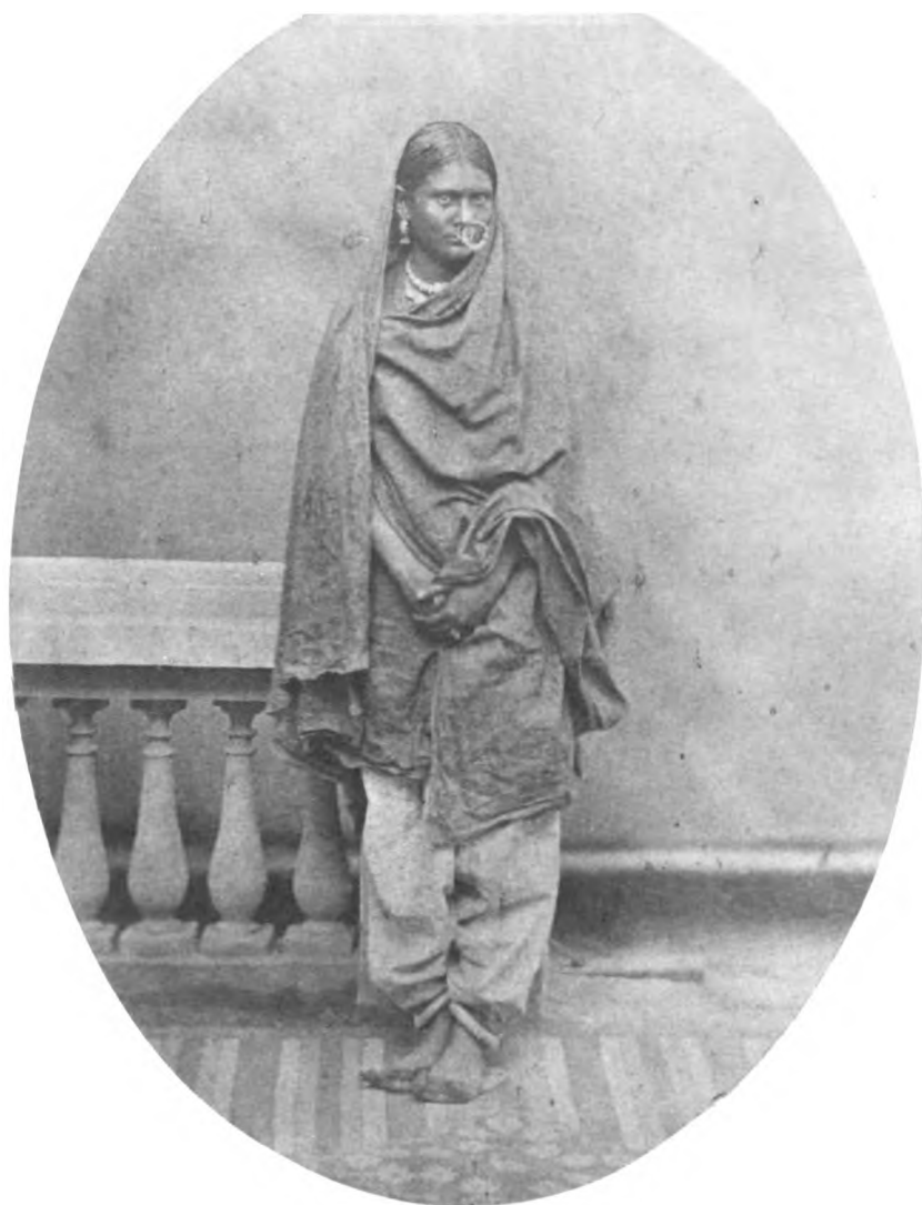
MOHANA WOMAN. SOONNEE MUSSULMAN. SIND. 338-2.