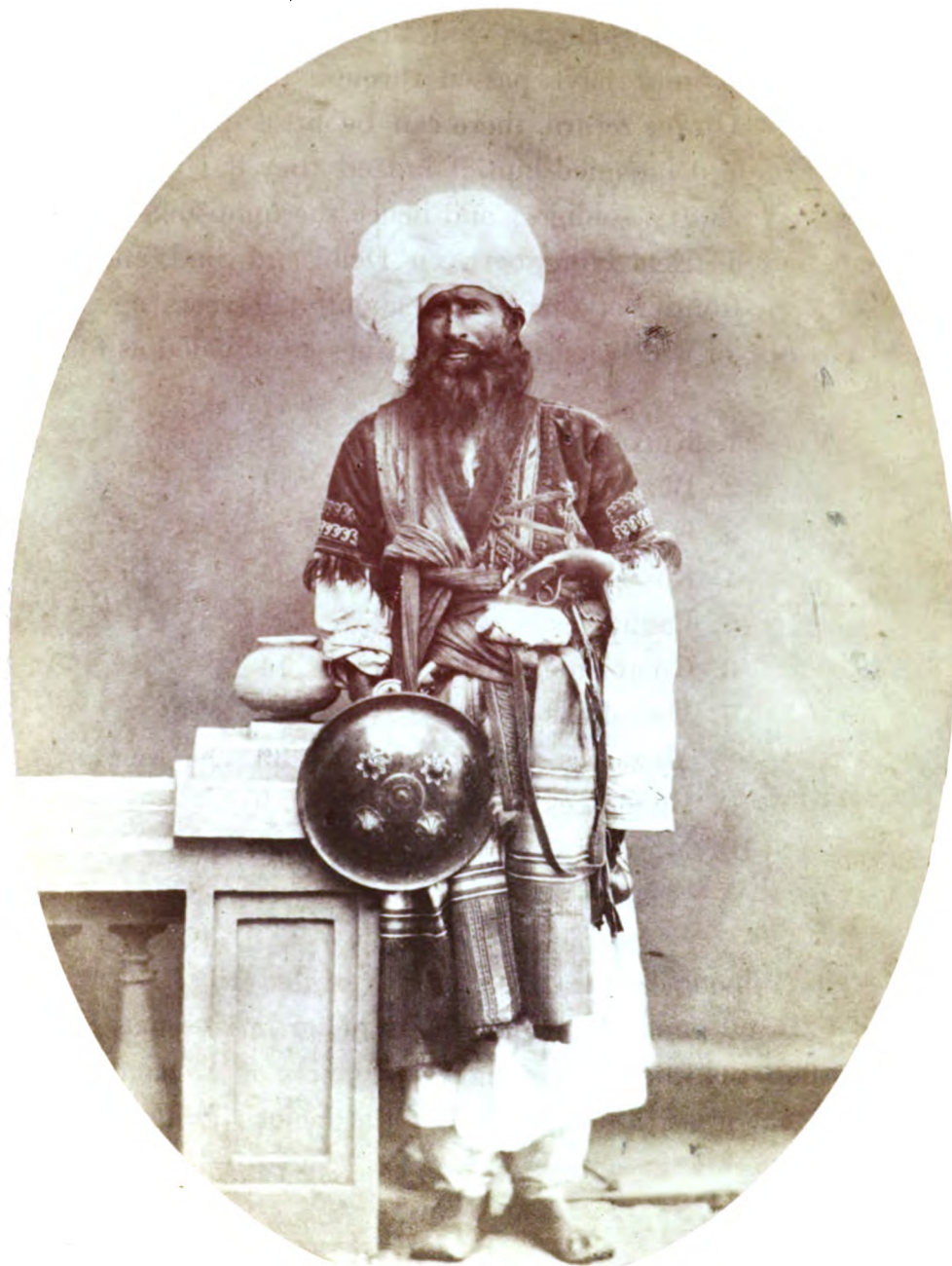
RIND. BELOCH TRIBE. SOONNEE MUSSULMAN. SIND. 298.