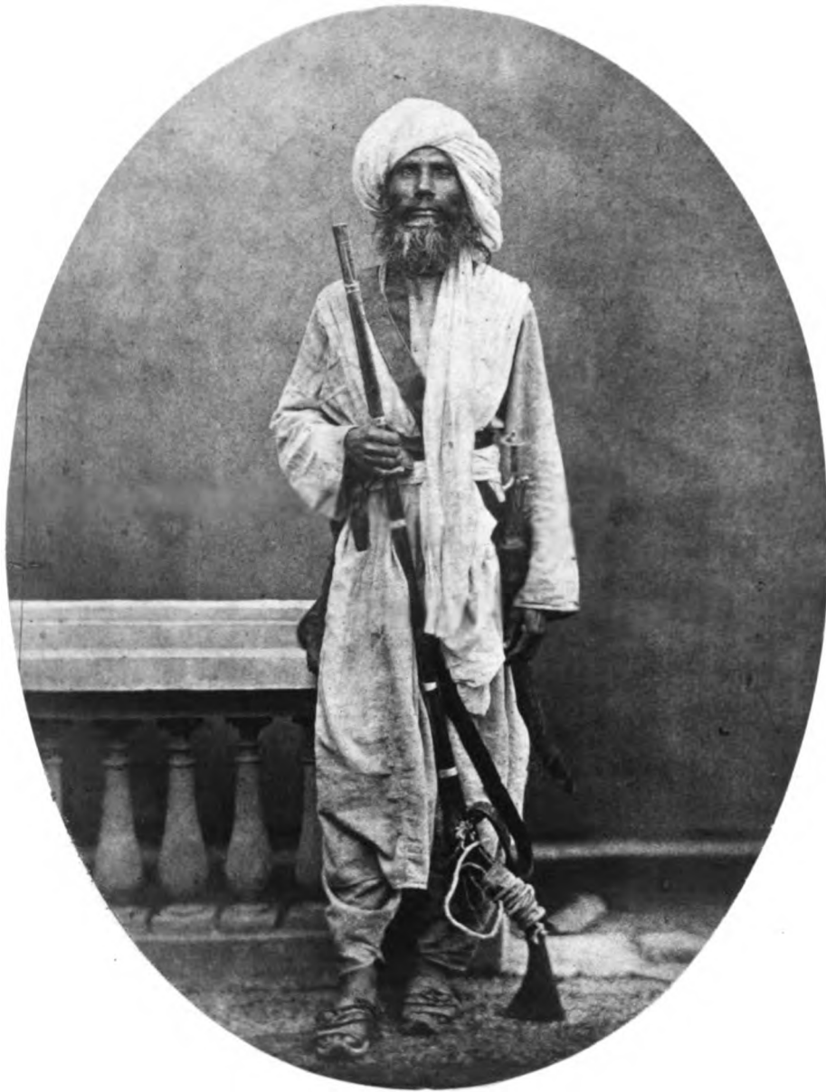
GABOLE. BELOCH MILITARY TRIBE. SOONNEE MUSSULMAN. SIND. 308.