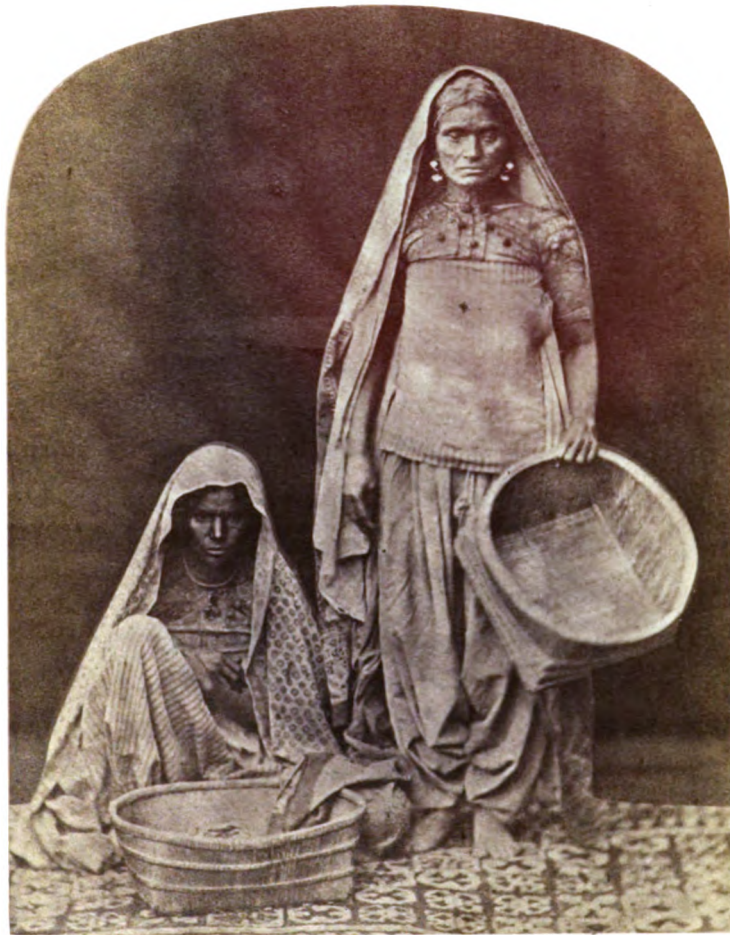
SELLERS OF FISH. MUSSULMANS. SIND. 339.