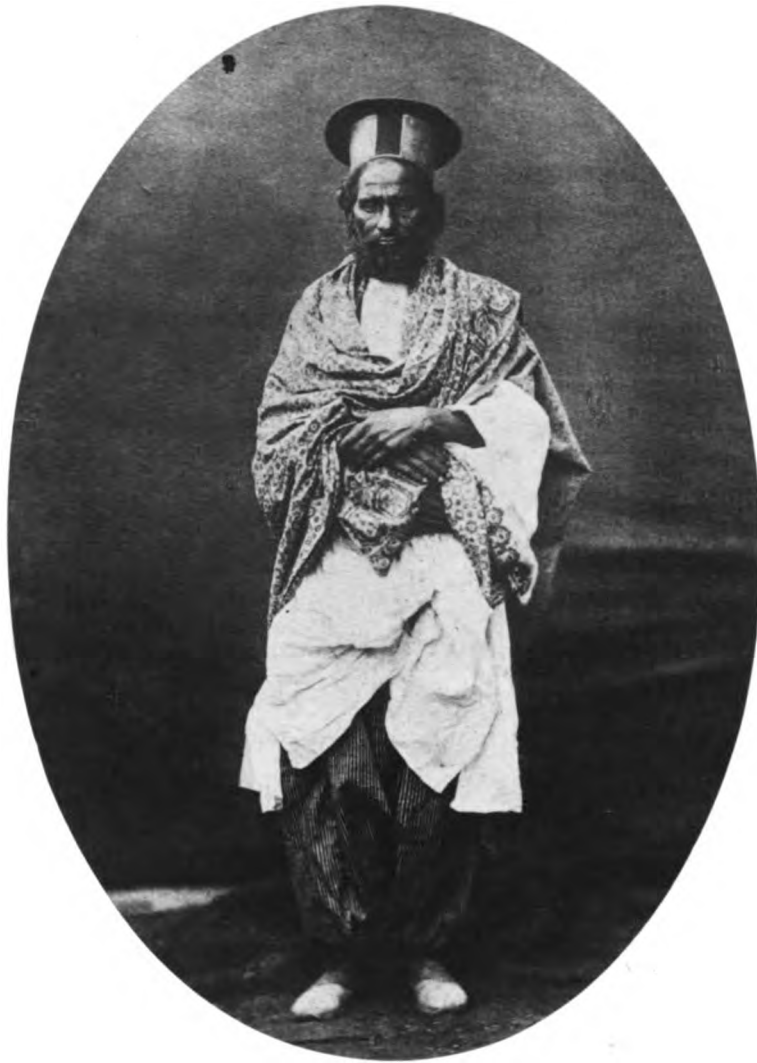
A PONHAR, ANCIENT SINDEE TRIBE. SOONNEE MUSSULMAN. SIND. 315.